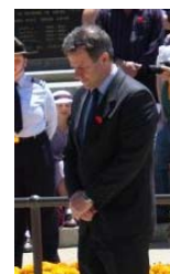
Lest we Forget ...Page 6