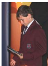
History Achievement ...Page 3