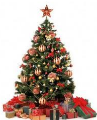
Division drinks ...Page 2